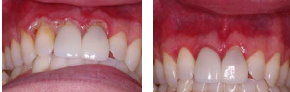
Photo on the right is 2 weeks after the one on the left. The photo below is more common with the punched out papillae.

Brush with an ultra soft brush 3 X day and floss