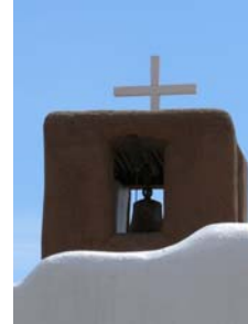
Success is failure turned inside out.