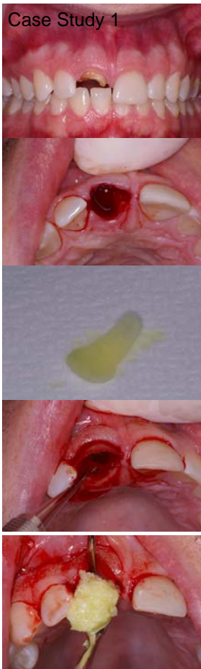
Case Study 1